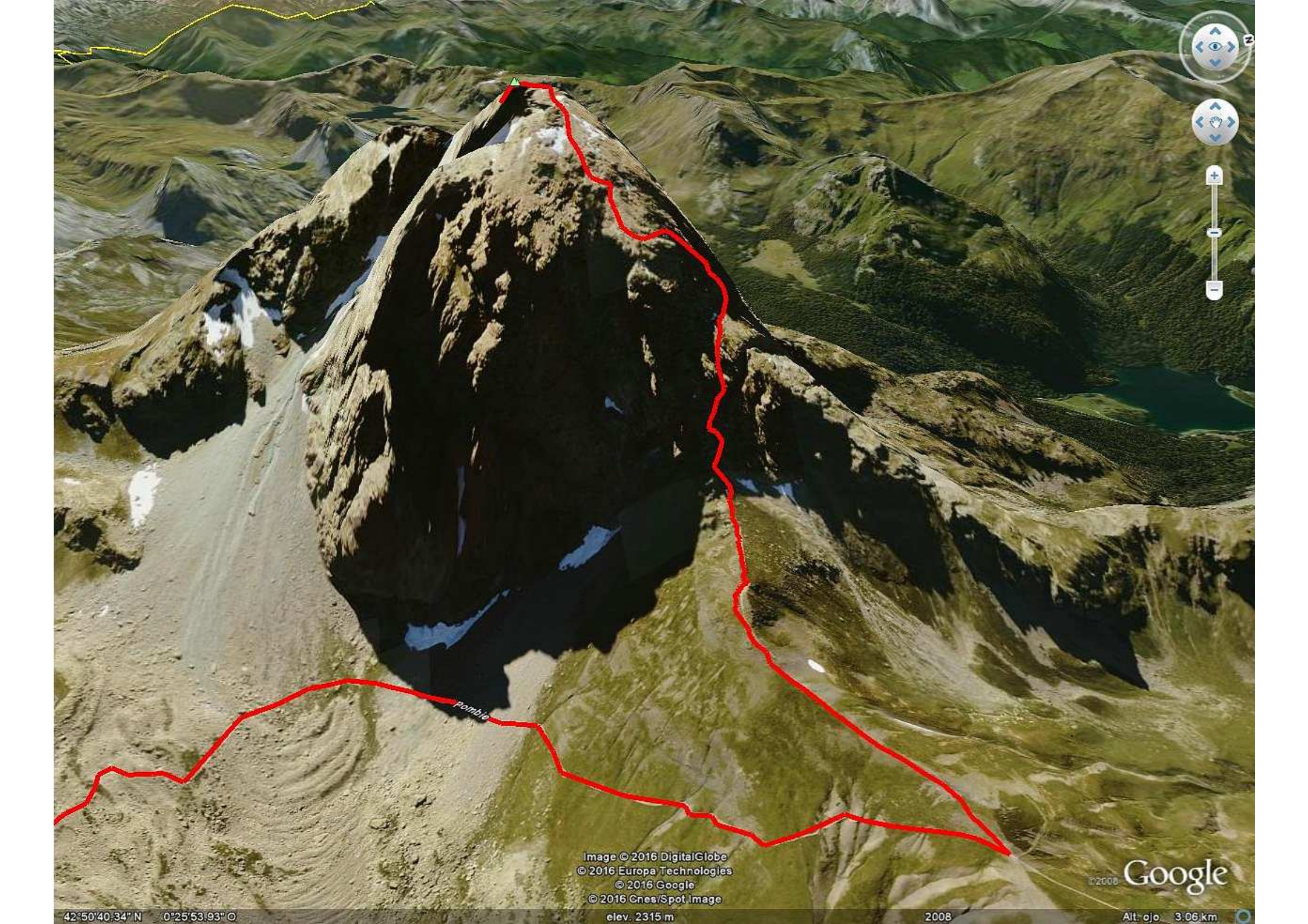
elev. 2315 m